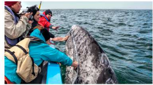
Locally-guided close up encounter with the majestic Pacific gray whale.

Hotels and itinerary subject to change (of equal or greater value), not affecting the cost of the tour. Airfare not included