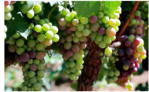
Walk through Baja California's sun-kissed vineyards that make up Ensenada's award-winning wines.