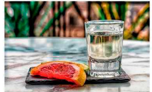
See the process of creating savory Mezcal from the heart of the blue agave plant.