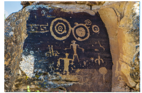
View ancient petroglyphs that told the stories of the Hopi people.