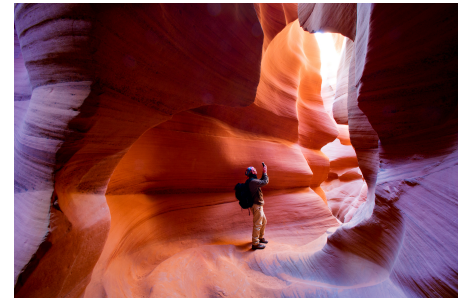
Walk through and experience the wonder of Antelope Canyon, a unique geological formation.